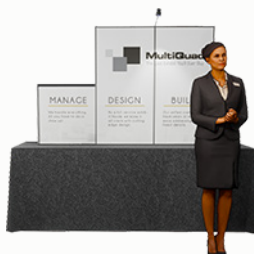
Table drape and carpeting not included

Add GRA-THROW-6to8 - Adjustable Table Throw $2,346